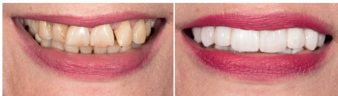
edelweiss discoloured / shortened teeth case

Dear Doctor, we welcome you to the edelweiss dentistry family!