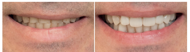
edelweiss full mouth rehabilitation case